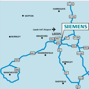
Location map of new factory

The office is situated just off junction 44 on the M1 motorway. The nearest hotel is only a few minutes away. Should you wish to stay, please contact the Queens Hotel on 0113 270 4519 to make a reservation.